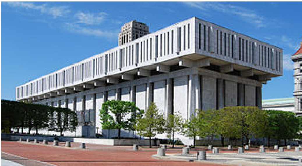
The Legislative Office Building in Albany,

To support this extension of services, please make your voice heard by calling or emailing (1) the bill sponsors (2) the committee chairs and (3) your own New York State legislators. If you have a child who would benefit, be sure to mention your personal situation and include your child's name. Sample letters are provided for your convenience.